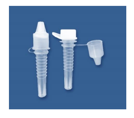
Cat. No: TUBE-CD04 Extration Tube 4