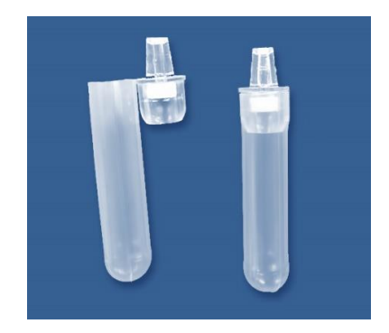
Cat. No: TUBE-CD01 Extration Tube 1