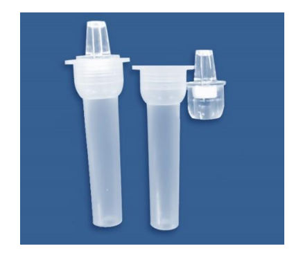
Cat. No: TUBE-CD07 Extration Tube 7